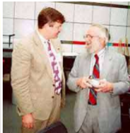
With Dr. Nicholas Negroponte at M.I.T. With Dr. Seymour Papert at M.I.T.

He was asked by CIDA, the Canadian International Development Agency, and the World Bank to present his thoughts and work at the Global Knowledge '97 conference in Toronto on the topic of "Universal Access to Information and Communication Technologies". At this conference, former World Bank President Mr. James Wolfensohn praised the impact of this work. He has also been an advisor to the Inter-American Development Bank (IDB) and the U.S. Peace Corps. His pioneering work has been featured at an exhibit at the Canadian Museum of Civilization as one of Canada's "Global Heroes".